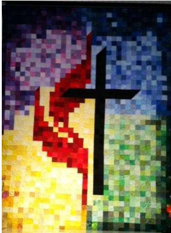
Quilt from Wesley UM Church in Georgetown DE