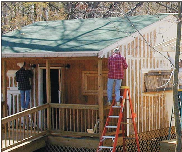
The Felton cabin is painted while St. Mark's-Easton goes up

For more information about these or any other pro-