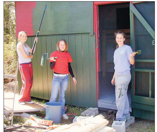
Ewell-St. Paul's gets a new coat of paint