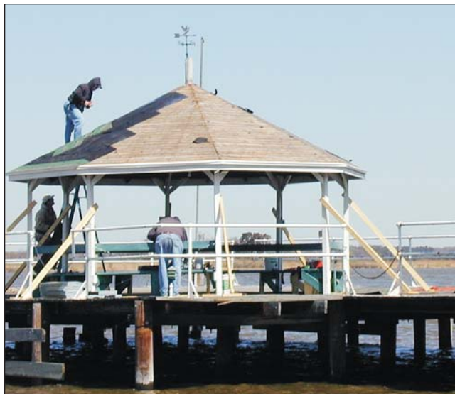
The Pavilion gets a new roof

Volunteer Day projects included: continuation of the new St. Mark's-Easton cabin on Boys' Hill and new Connection-Middletown cabin in the Barn Area; stabilization of the Pier Pavilion and replacement of the roof; renovations to two cabins which will be used to house volunteers; clearing of a new waterside trail system behind the Bunkhouse Area; mulching in the new Pioneer Area; painting the interior of the Talley House, the interior and exterior of two Barn Area Cabins, and exterior painting of the Administration Building; and preparation of various cabins for the Spring rental and Summer Camp seasons by sponsoring churches.