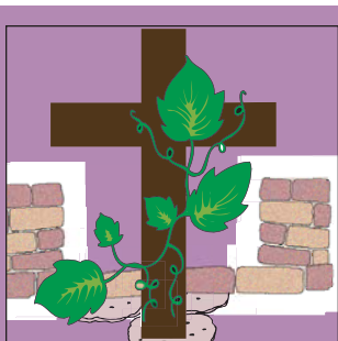
Annual Conference Agenda