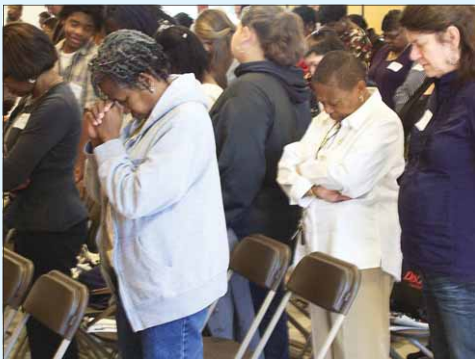
Praying at "The Well"

The Family returned home to see their new dream home on Tuesday, October 4th, surrounded by Family and Friends with the shout of "Move That Bus". The episode of Extreme Makeover: Home Edition with the Johnson-Goslee family aired on December 9, 2011. We can truly say that God is still in the blessing business. It's Your Season.