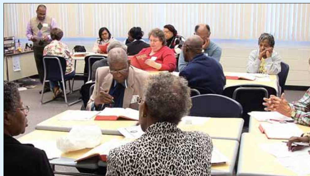
Small group discussion at "The Well." People learning and growing together